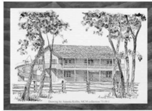
Mendocino County Museum