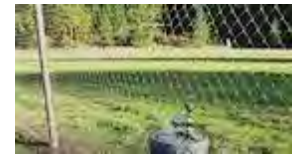
Redwood Little League