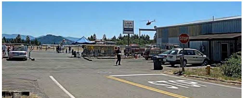
Airport Day at Ells Field