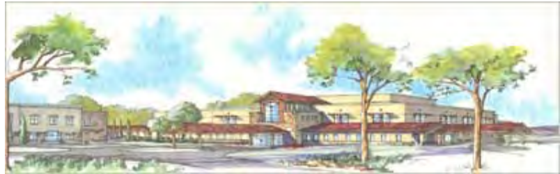
Howard Memorial Hospital