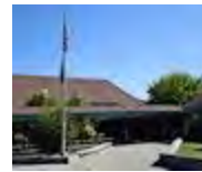
Willits School District